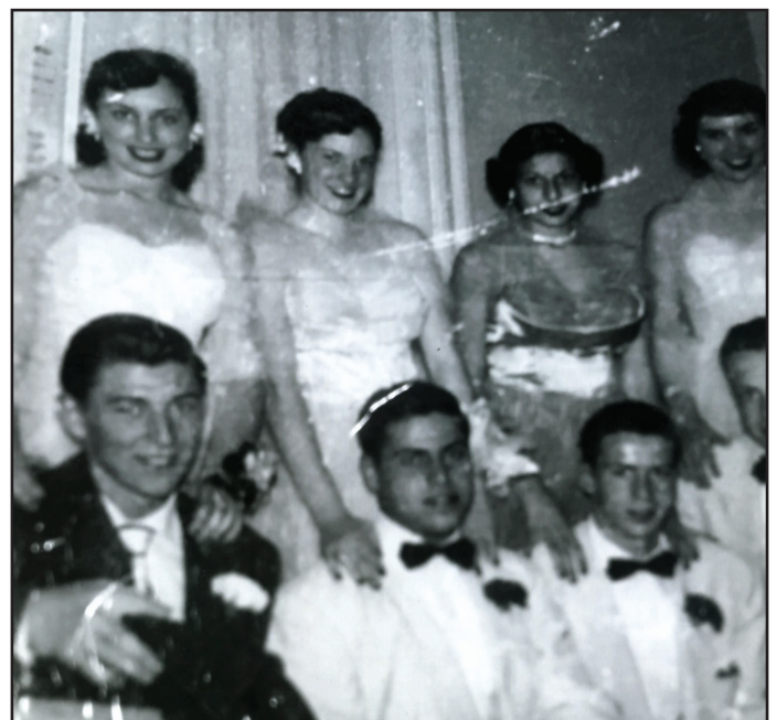
Roxbury Memorial High School Prom - 1953

William F. Buckley said, "White revolutionized the art of political reporting." About the 1960 presidential campaign, White wrote, It was my thought that historians would tell the story of the quest for power in more precise terms with greater wealth of established fact, there might, nonetheless, be some Permanent value in the effort of a contemporary reporter to catch the mood and the strains, the weariness, elation and uncertainties of the men who sought to lead America in the decade of the sixties." In a step toward transparency, after six decades of secrecy, our government released a tranche of secret documents that some historians and conspiracy theorists hope will shed more light on the 1963 assassination of President Kennedy.